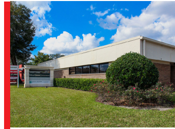
541 E Horatio Ave Maitland, FL