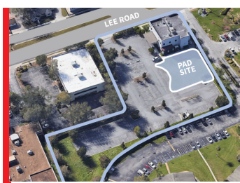
1691 Lee Rd Winter Park, FL