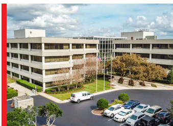
Maitland Lakes 851 Trafalgar Ct Maitland, FL