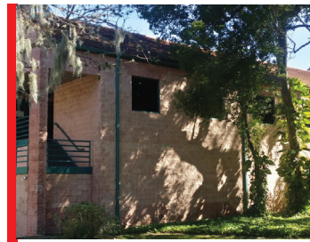
120 E Marks St Orlando, FL