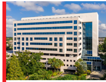
Sand Lake IV - Suite 600 7380 Sand Lake Rd Orlando, FL