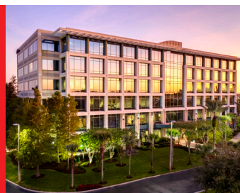
Millenia Park One 4901 Vineland Ave Orlando, FL