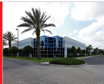
Discovery Lake 2501 Discovery Dr Orlando, FL