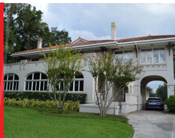
214 South Lucerne Cir Orlando, FL