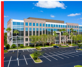
Resource Square III 12001 Research Pky Orlando, FL