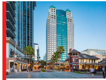
200 South Orange 200/222/250 S Orange Ave Orlando, FL