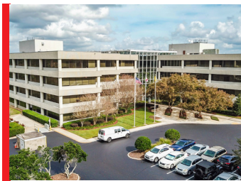
Maitland Lakes 851 Trafalgar Ct Maitland, FL