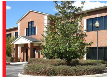
549 Wymore Rd Maitland, FL