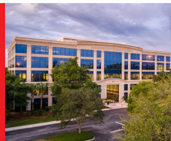
Northpoint Center I 1025 Greenwood Center Lake Mary, FL