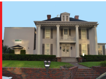
419 N. Magnolia Ave. Orlando, FL