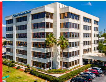
2699 Lee Rd Orlando, FL