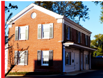
Clarissa Cottage 80 W Gore St Orlando, FL