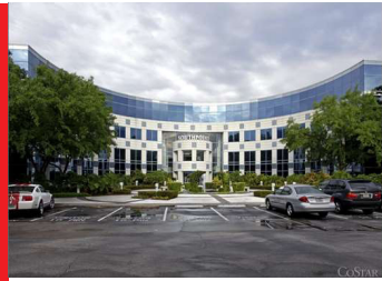
Southpoint Executive Center 151 Southhall Ln Maitland, FL