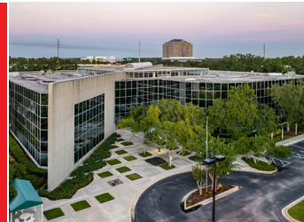
2600 Maitland Center Pky Suite 260 Maitland, FL