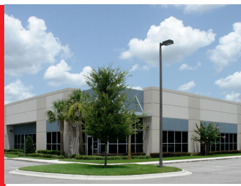
Southridge Commerce Park I 2966 Commerce Park Dr Orlando, FL