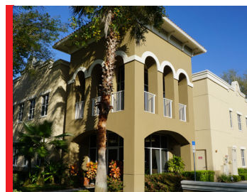
2707 E Jefferson St Orlando, FL