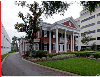
Clarendon Place 80 W Gore St Orlando, FL