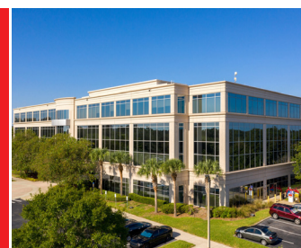
Northpoint IV 1064 Greenwood Blvd Lake Mary, FL