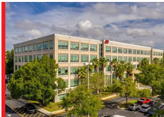
Eastwoods at Maitland Preserve 2405 Lucien Way Maitland, FL