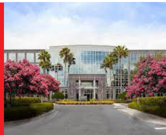
Primera Tower IV 300 Primera Blvd Lake Mary, FL