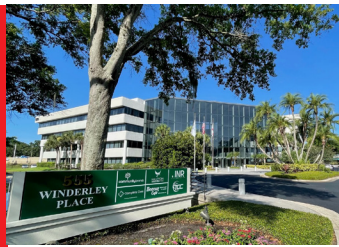
555 Winderley Place Maitland, FL