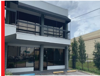
641/644 W Michigan St Orlando, FL