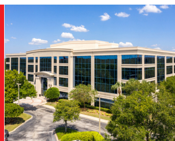
Northpoint Center II 1035 Greenwood Blvd Lake Mary, FL