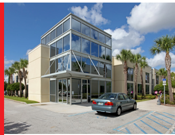
Alafaya Corporate Center 1900 N Alafaya Trl Orlando, FL