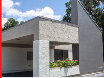
1723 Lucerne Terrace Orlando, FL