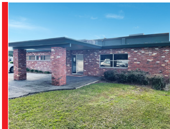
11 Lake Gatlin Rd Orlando, FL