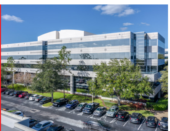
Westwood Corporate Center, Phase III 6675 Westwood Blvd., Orlando, FL