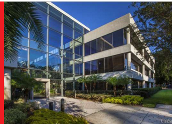
Maitland 100 2300 Maitland Center Parkway Maitland, FL