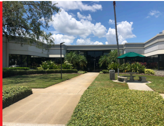
6751 Forum Dr Orlando, FL