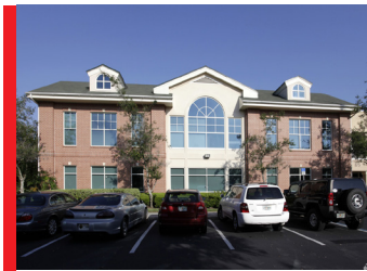
Maitland Concourse South 800-875 Concourse Pky South Maitland, FL