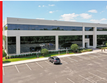
University Park Building 300 3505 Lake Lynda Dr Orlando, FL