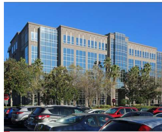
Primera Tower II 615 Crescent Executive Ct Lake Mary, FL