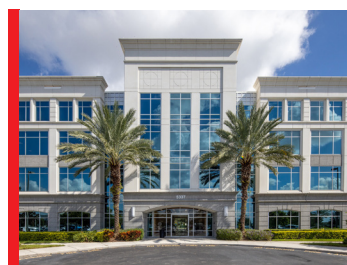
5337 Millenia Lakes Blvd Orlando, FL 32839