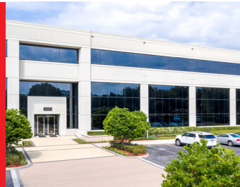
University Park Building 500 11315 Corporate Blvd Orlando, FL