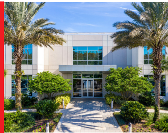
Building H 8325 South Park Cir Orlando, FL