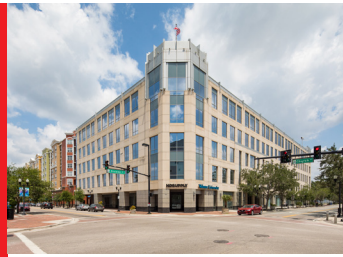
501 W Church St Orlando, FL