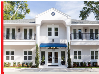
1071 W Morse Winter Park, FL