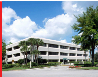
Vistana Office Plaza 8801/8803 Vistana Center Orlando, FL