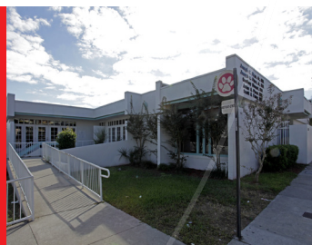
1131 S Orange Ave Orlando, FL