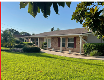
116 Gatlin Ave Orlando, FL