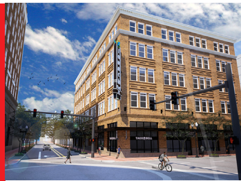
One South Orange 1 S Orange Ave. Orlando, FL