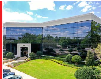
University Park Building 200 3504 Lake Lynda Dr Orlando, FL