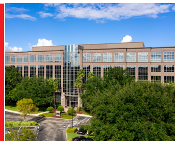
Primera Tower V 255 Primera Blvd Lake Mary, FL