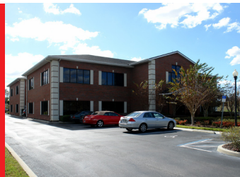
557 N Wymore Rd Maitland, FL