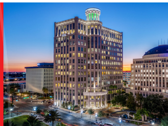
CNL Center I 450 South Orange Ave. Orlando, FL