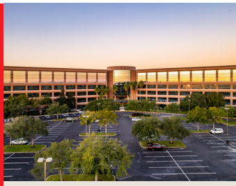
Discovery Point 2300 Discovery Drive Orlando, FL