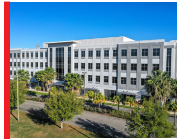
Kirkman Point II 7141 S Kirkman Rd Orlando, FL