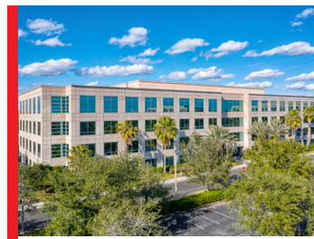
Southpark Center West 9002 San Marco Ct Orlando, FL