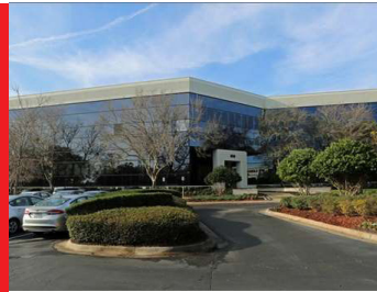
University Park Building 100 3452 Lake Lynda Dr Orlando, FL