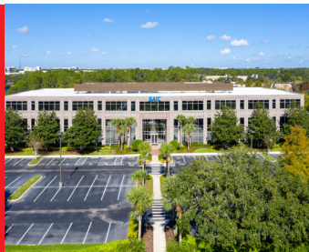
Resource Square I 13501 Ingenuity Dr Orlando, FL