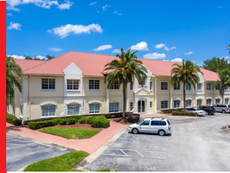
Metrowest Medical Center 1781 Park Center Dr Orlando, FL