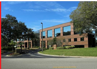
Maitland Colonnades 2301 Lucien Way Maitland, FL