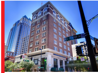
100 S Orange Ave Orlando, FL