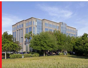
Primera Tower I 610 Crescent Executive Ct Lake Mary, FL