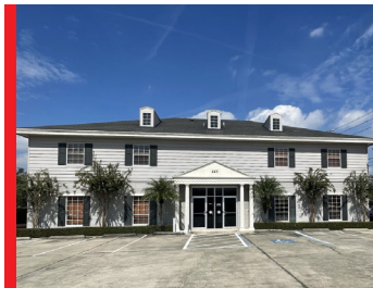
227 S Orlando Avenue Winter Park, FL