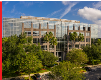
Primera Tower III 605 Crescent Executive Ct Lake Mary, FL